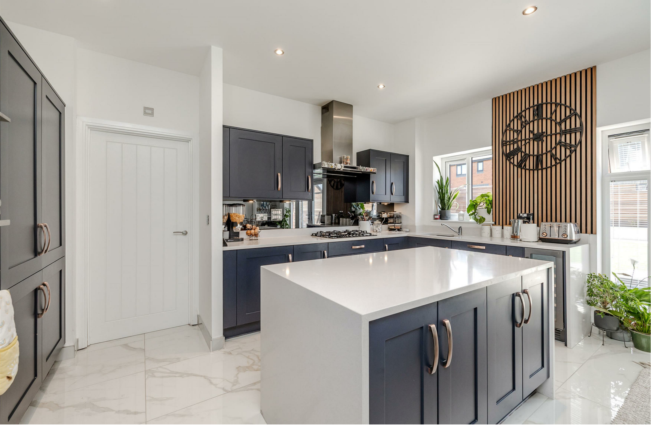
2 Finch Mews, Abbey Heights, Newcastle upon Tyne, NE15 9FG